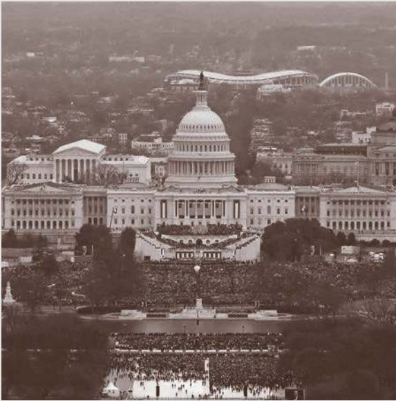
Since taking office, President Trump and Congressional Republicans have set their sights on dismantling crucial worker protections for the benefit of corporations and the uber-wealthy.

In these pages, we look at how far we've come as a movement, how much we've accomplished just in the past year, and how we're fighting back now and girding for the tough fights ahead.